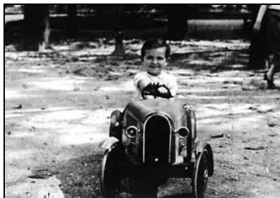
Robert in a toy pedal car

Robert Faurisson was born in Shepperton, England, in January 25, 1929, of a French father and a Scottish mother. The eldest of seven children, his first schooling was in Singapore and in Kobe, Japan; from the age of seven, he attended various French catholic institutions, including a Jesuit college in Marseille and, in Paris, the Collège Stanislas. He pursued his studies in classics in Paris at the Lycée Henri-IV and the Sorbonne. He holds the agrégation des lettres (French, Latin, Greek) and a doctorate in “ literature and the social sciences .” He taught modern and contemporary French literature at the Sorbonne. At the Université Lumière of Lyon, he developed a structure for the teaching of “ Criticism of texts and documents (literature, history, media) ”. In the 1960s and 70s, he made a name for himself with his method of decrypting literary works with a reputation for difficulty; in that period he published A-t-on lu Rimbaud? , A-t-on lu Lautréamont? and La Clé des “Chimères” et “Autres Chimères” de Nerval . From the late 70s onwards, he applied the same direct and pragmatic method to the study of difficult historic or literary subjects: the problem of the Nazi gas chambers, the ‘confessions’ of the SS, the ‘Diary of Anne Frank,’